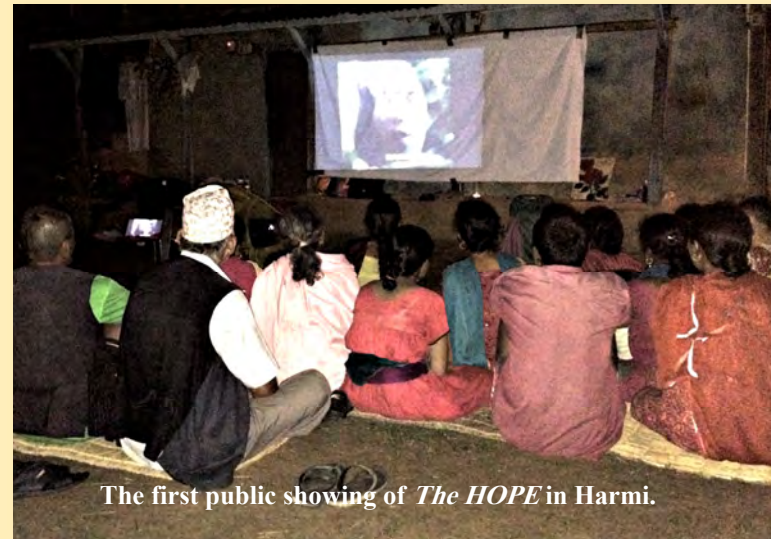
The first public showing of The HOPE in Harmi.