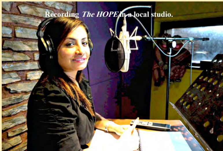
Recording The HOPE in a local studio.

Praise God with us that Nepali speakers no longer require multiple translators! You can download The HOPE at www.1040connections.org/nepalihope . Please use and share this powerful tool among any Nepali's you know.